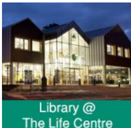
Library @ The Life Centre

Green Wrythe Lane, Carshalton SM5 1JJ Telephone: 020 8648 6608 Email: circle.library@sutton.gov.uk