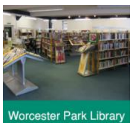
Worcester Park Library

Mollison Drive, Roundshaw, Wallington SM6 9NZ Telephone: 020 8770 4901 Email: phoenix.library@sutton.gov.uk