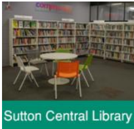
Sutton Central Library