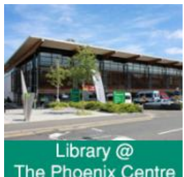
Library @ The Phoenix Centre

Alcorn Close, Sutton, SM3 9PX Telephone: 020 8644 9696 Email: lifecentre.library@sutton.gov.uk